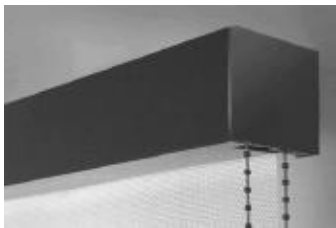
Fascia Available in 3", 4", 5" Regular Roll Only No Fabric Insert