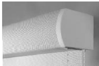
Cassette Available in 3", 4" Regular Roll Only Fabric Insert