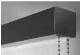
Fascia Available in 3", 4", 5" Regular Roll Only No Fabric Insert